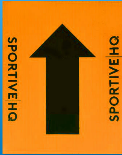
Medium Route Orange