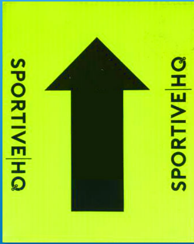
Main/Long Route Yellow

The second split is next where the Medium route will then follow Orange Signs. The Long route will continue to follow Yellow signs all the way to the finish.