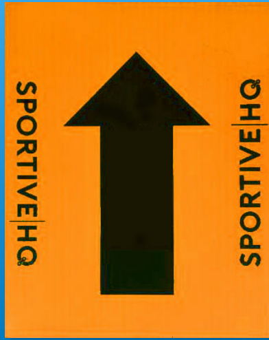
Medium Route Orange