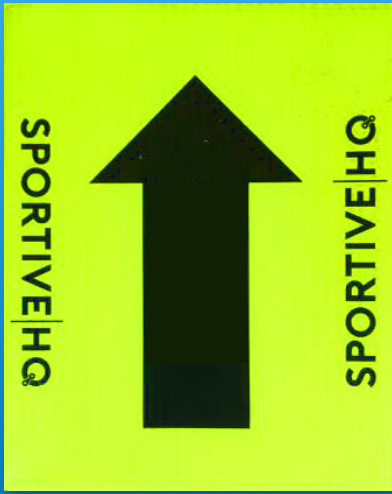
Main/Long Route Yellow

The second split is next where the Medium route will then follow Orange Signs. The Long route will continue to follow Yellow signs all the way to the finish.