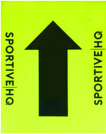
Main/Long Route Yellow