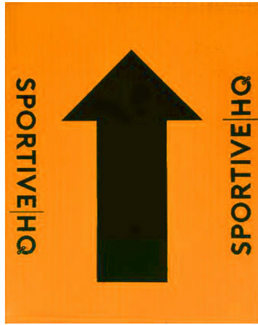
Medium Route Orange