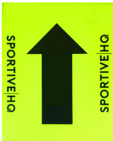
Start to 100 mile

The route starts by following bright yellow arrows. This will continue for the first 100 miles. The orange arrows will then begin and continue for 75 miles. The last 25 miles are covered by green arrows.