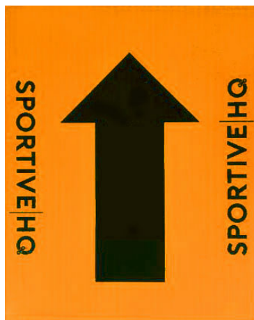
100 to 175 mile