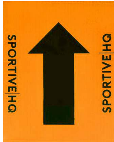
Medium Route Orange