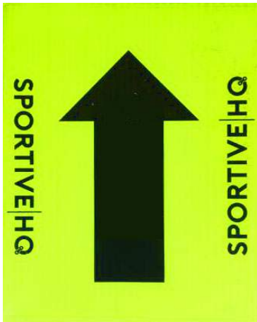
Long / Main Route - Yellow