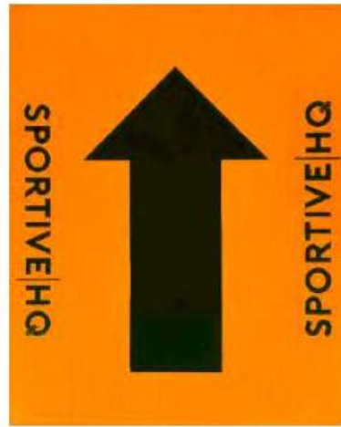
Medium Route Orange