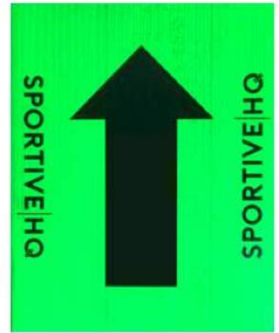
Short Route Green

Mechanical Support Whilst it is your responsibility to come to the event with a mechanically sound cycle we will have support at HQ, mobile support from our fully qualified cycle mechanics. We will do our best to keep you going but please turn up on a fully serviced bike and try to look after yourself in terms of punctures and simple problems.