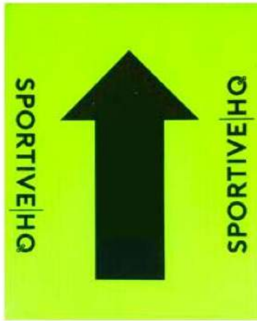
Main/Long Route Yellow